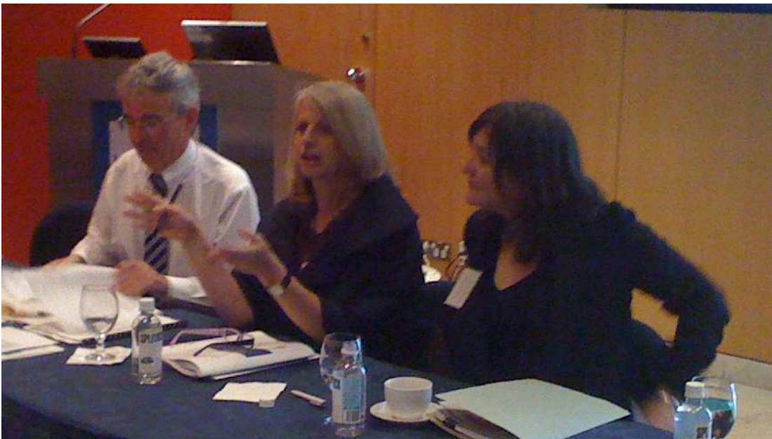
List of the Panelist at the National Garment Roundtable