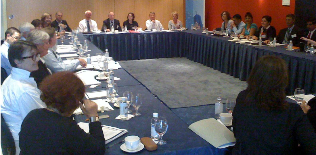
Image of the attendees at the National Garment Roundtable