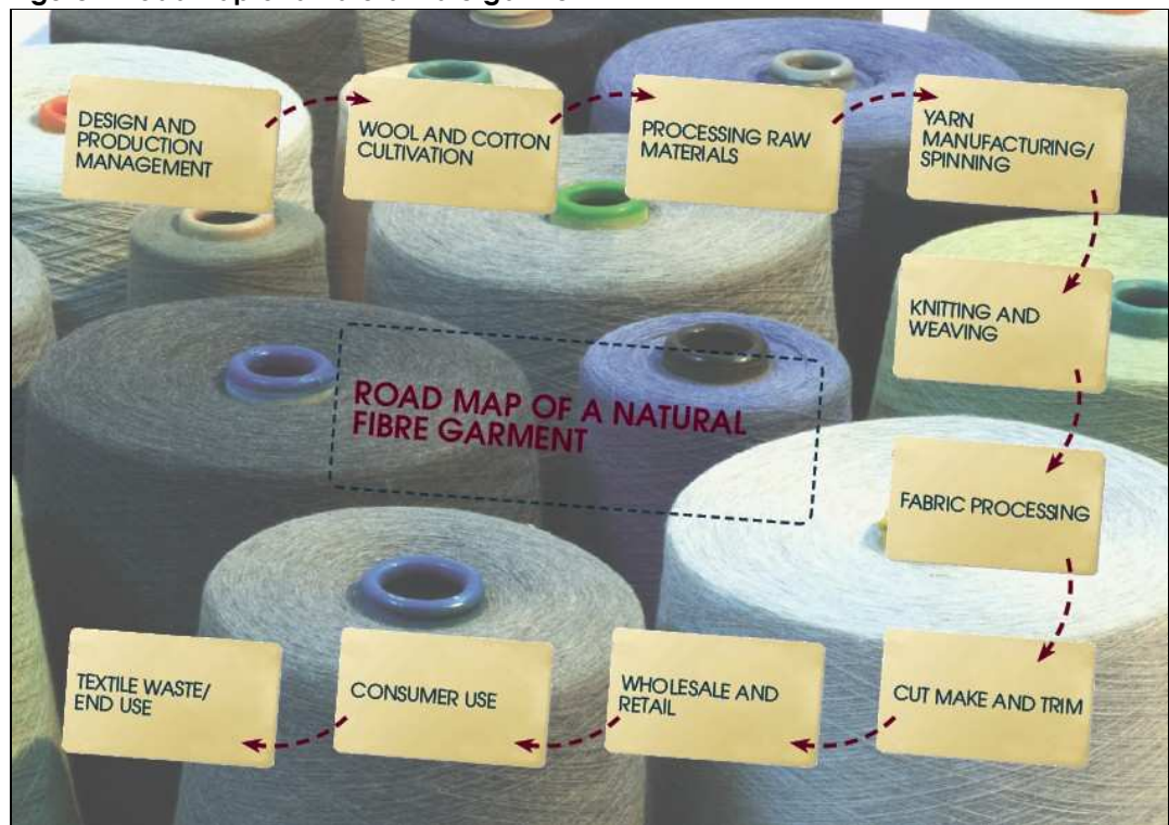
Figure 1 Roadmap of a natural fibre garment

A typical roadmap includes consideration of the design, fibre cultivation, production, selling, consumption and disposal phases. These are the building blocks; however, each roadmap will vary in complexity according to the size of the enterprise, industry sector, the production process, and the global dimensions. Figure 1 shows the roadmap of a natural fibre garment.